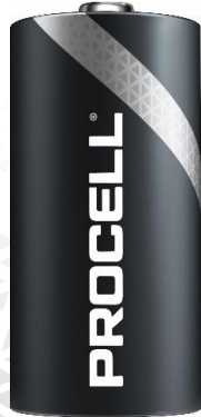
Size: C (LR14) PC1400